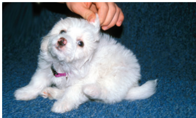
FIGURE 5-46 Canine Scabies. A positive pinnal-pedal reflex is highly suggestive of scabies.