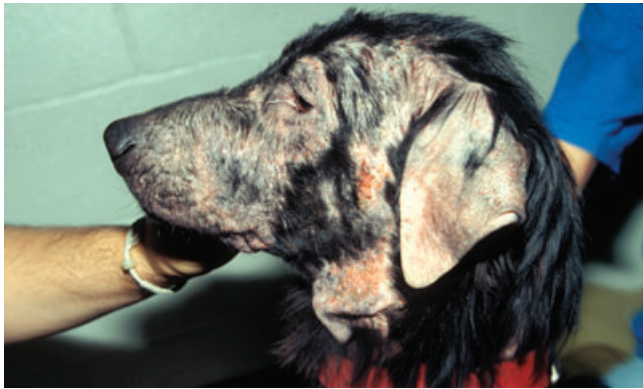
FIGURE 5-42 Canine Scabies. Generalized alopecia with a crusting papular dermatitis affecting the head and neck of a young adult dog. Note that the ear margins are severely affected.