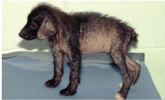
FIGURE 5-43 Canine Scabies. Generalized alopecia and crusts affecting a pruritic puppy. The alopecic ear pinnae are characteristic of scabies.